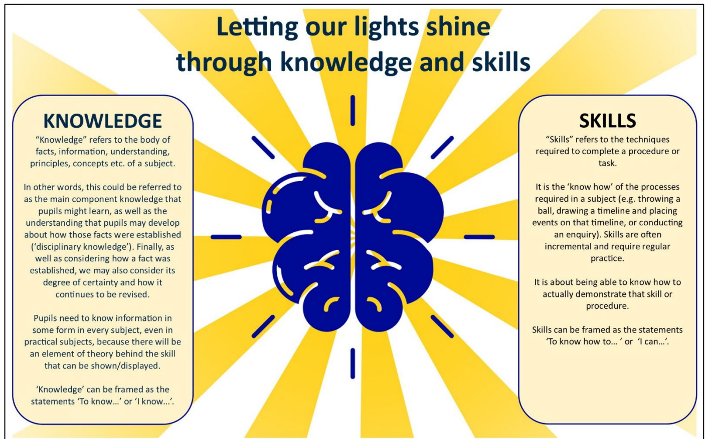
Polehampton's Infographic on Knowledge and Skills

2. Skills refers to the techniques required to complete a procedure or task. It is the 'know how' of the processes required in a subject (e.g. the actual skill of being able to use column method to add). Skills are often incremental and require regular practice. It is about being able to know how to actually demonstrate that skill or procedure.